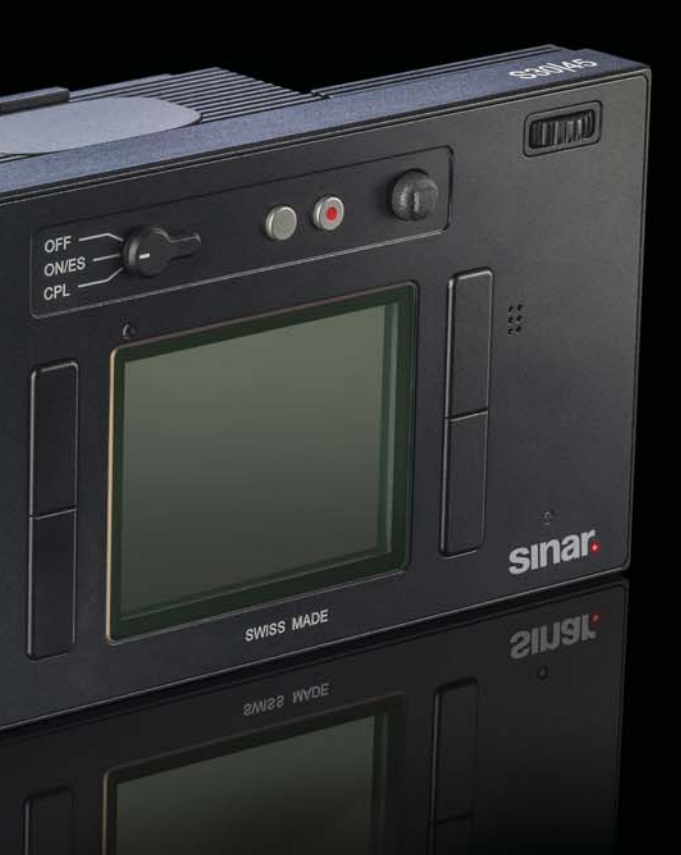
IMAGE DATA FORMAT DNG, DNG + JPEG, JPEG, DNG /JPEG Resolution DNG: 37.5 MP, JPEG: 37.5 MP, 9.3 MP, 2.3 MP

FILE SIZE DNG approx. 42 Mbyte, JPEG: approx.1-16 Mbyte